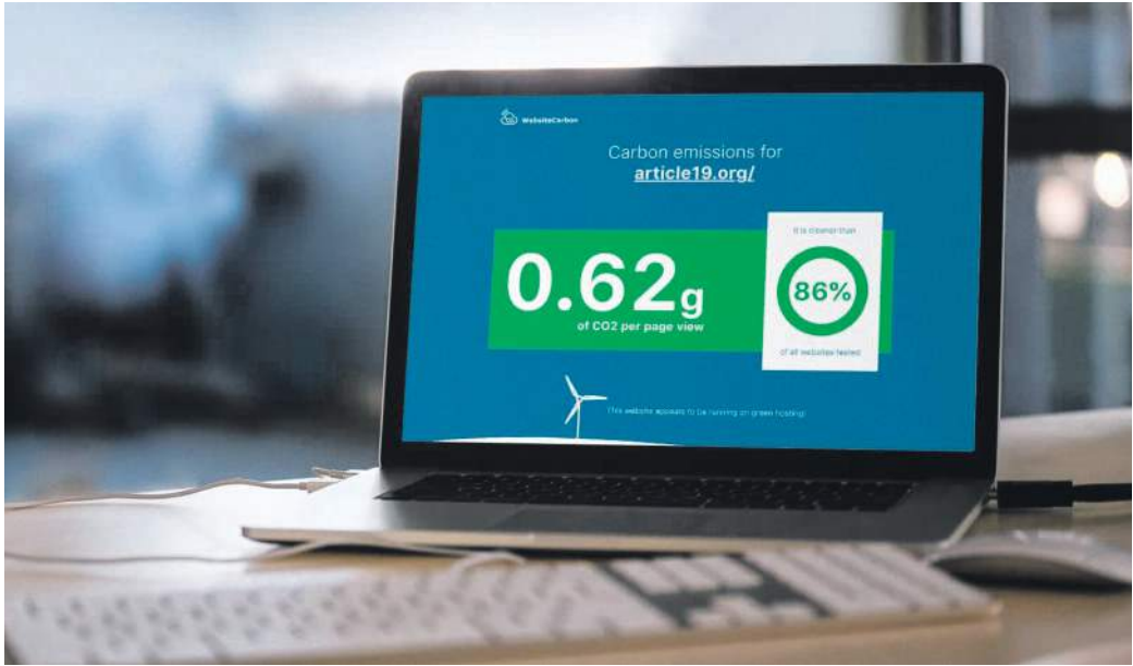
MAIN IMAGE By 2026, all Wholegrain Digital's clients' websites will be switched to servers powered by renewables ABOVE The Carbon Calculator reveals the emissions of any web page or website BOTTOM-LEFT The Wholegrain Digital team

Wholegrain Digital has pledged to slash 20% off the CO2 per page view of all clients' new websites