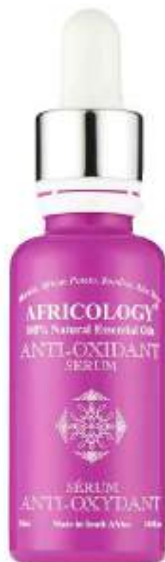
LEFT TO RIGHT Africology Anti-Oxidant Serum; incognito suncream insect repellent; NATorigin Lengthening Mascara; Inlight Intensive Line Softener

Mix into a paste and massage into damp skin. Rinse off with warm water.