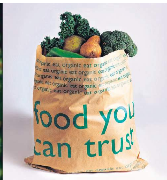
Buying organic supports the transition to an environment-enhancing food chain with human health at its heart

Fortunately, we already have such a system up and running: organic farming. We don't have all the answers, but it's a good place to start. Since its